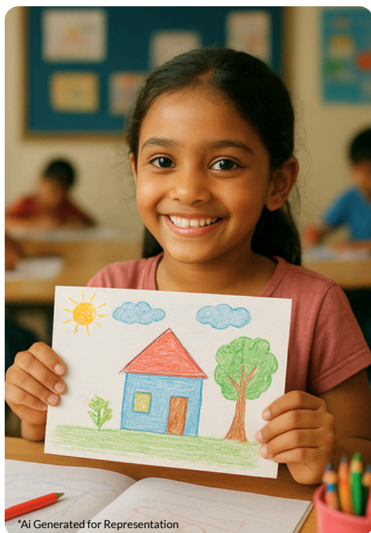
*Ai Generated for Representation